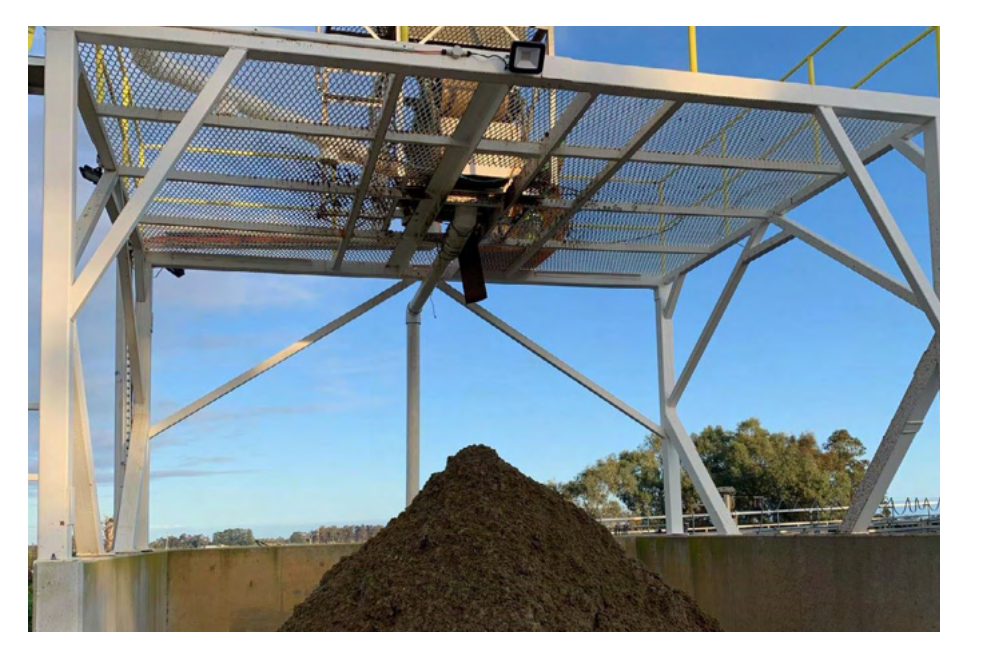
Mechanical solids separators provide dry solids that are easy to handle