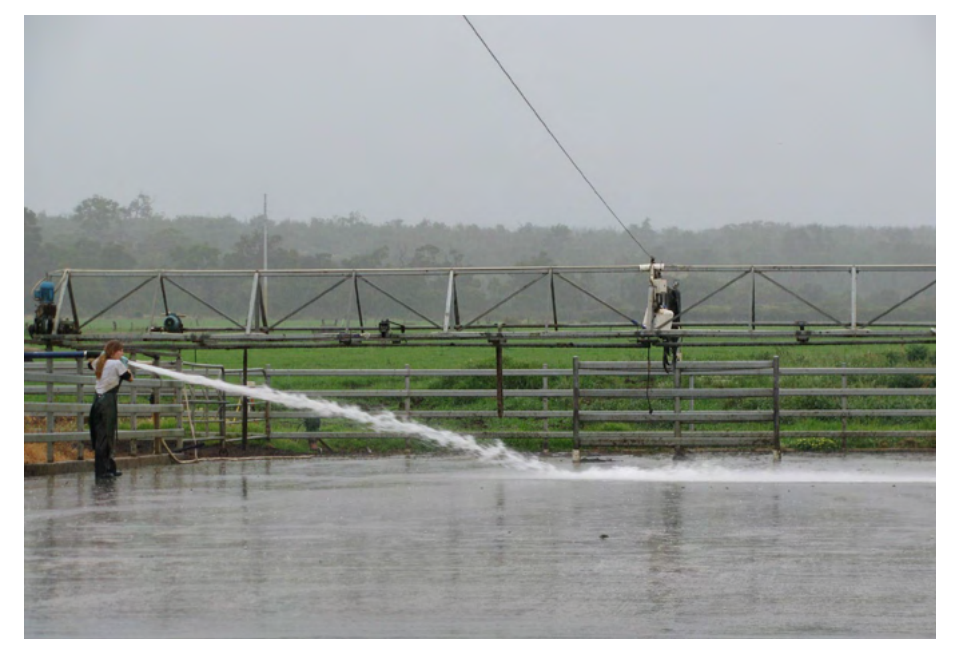
Minimising water use during yard wash reduces the volume of effluent generated each day

Reduced water use and diversion of stormwater from the dairy shed lowers the volume of effluent generated, minimising storage and pumping requirements.