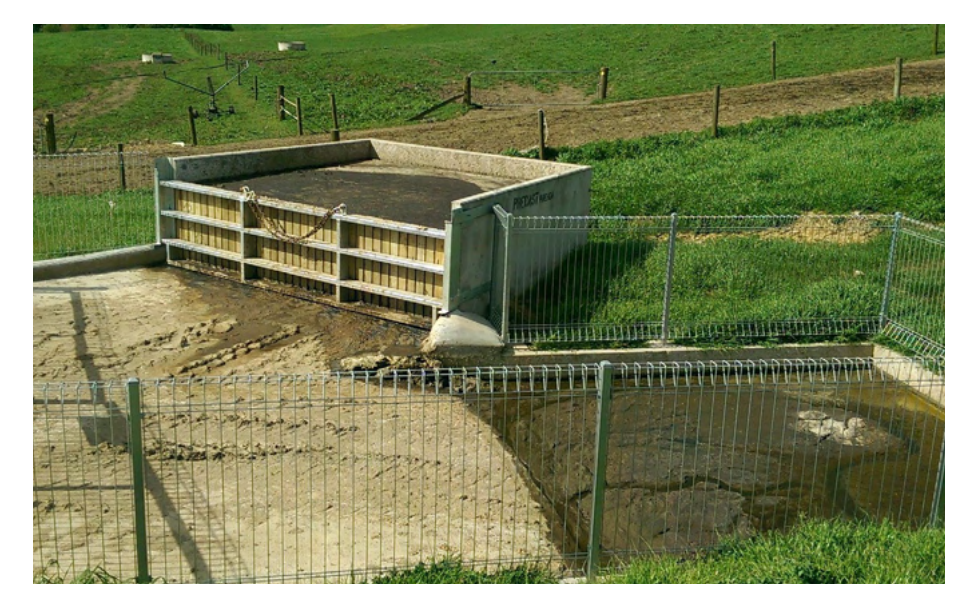
Solids storage bunker with weeping wall directs runoff back to sump