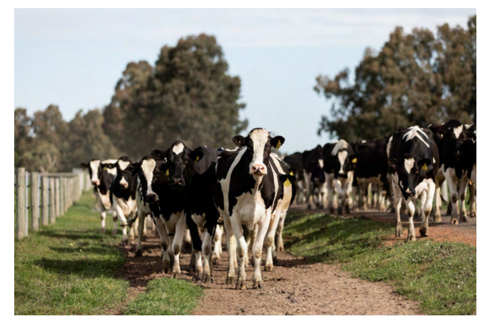
Scrape manure build up on road crossings to avoid impacting other users

5 DPI 2008, DairyGains Victorian Guidelines