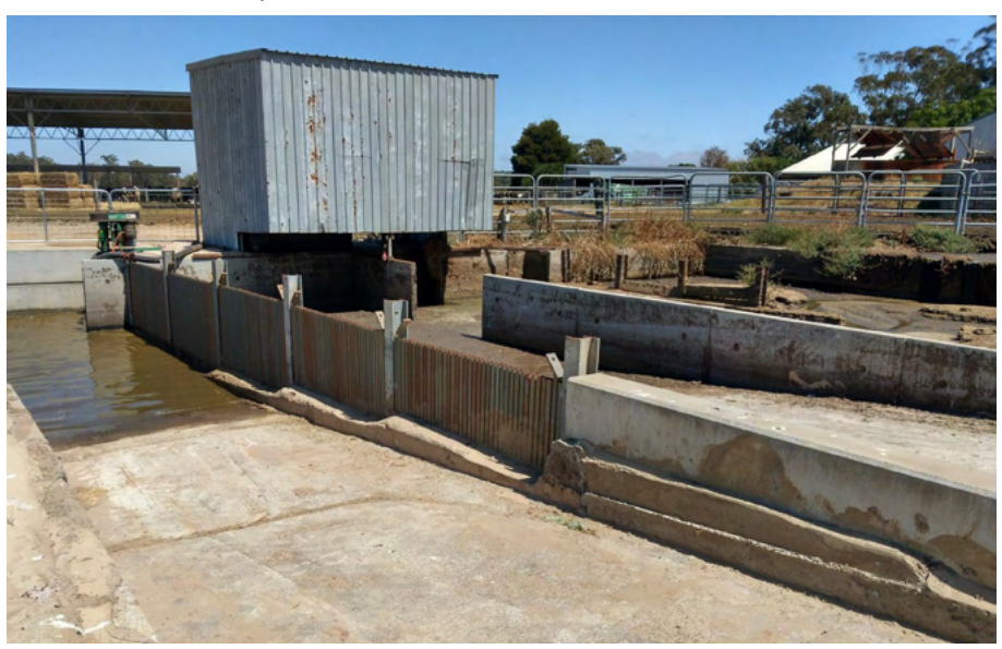
Multi-bay trafficable solids trap