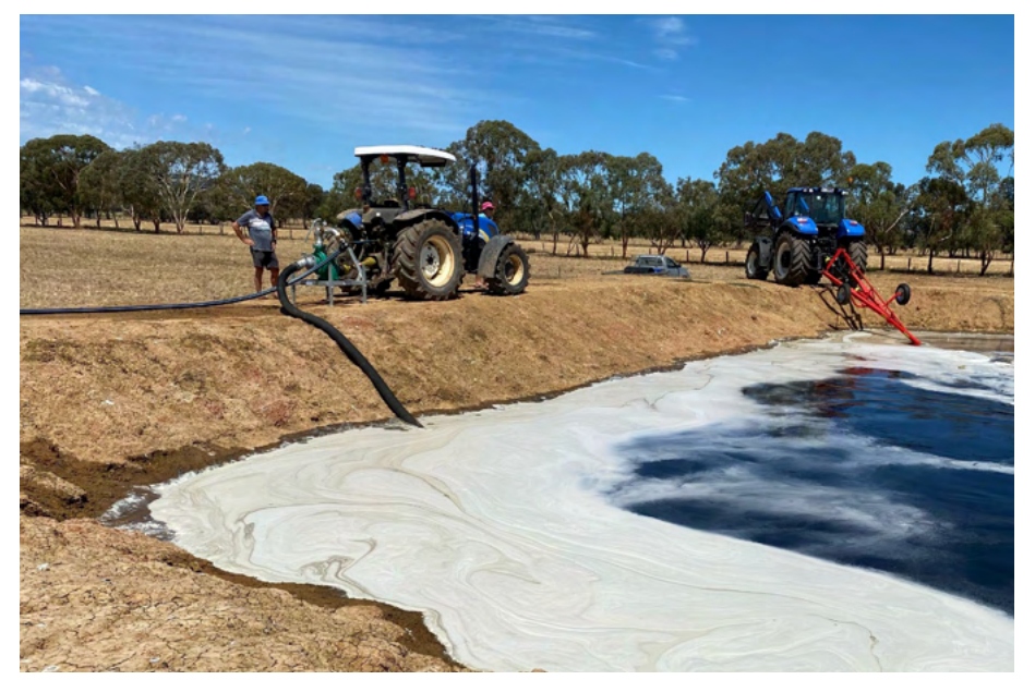
Solids management is required in single ponds to maximise storage capacity over wet periods