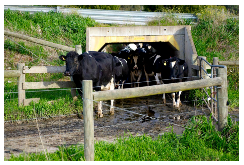
Regularly remove manure that collects on crossings such as underpasses

Impacts on water quality are minimised through the management of effluent that collects in areas around the farm, including areas that cattle frequently cross. Impacts on other users (e.g. neighbours) are also reduced.