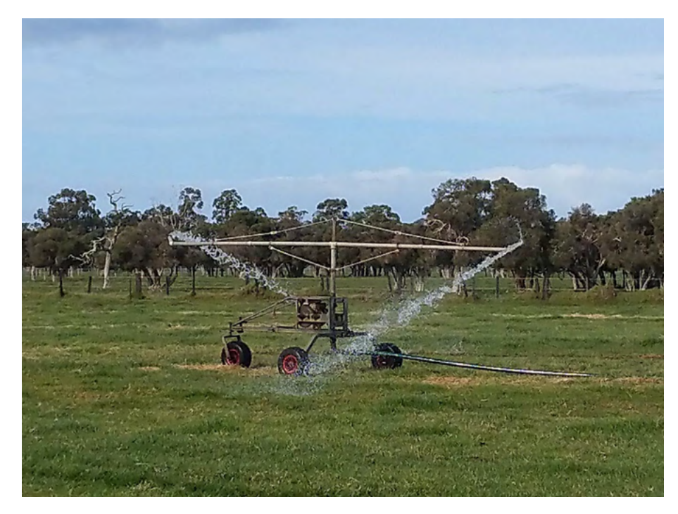
Traveling irrigators are a cost effective method to reuse effluent

The minimum period of time that will elapse between applying effluent to pastures and stock grazing those pastures.