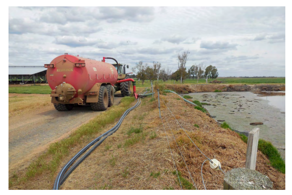
Effluent storages should be emptied by the end of March each year