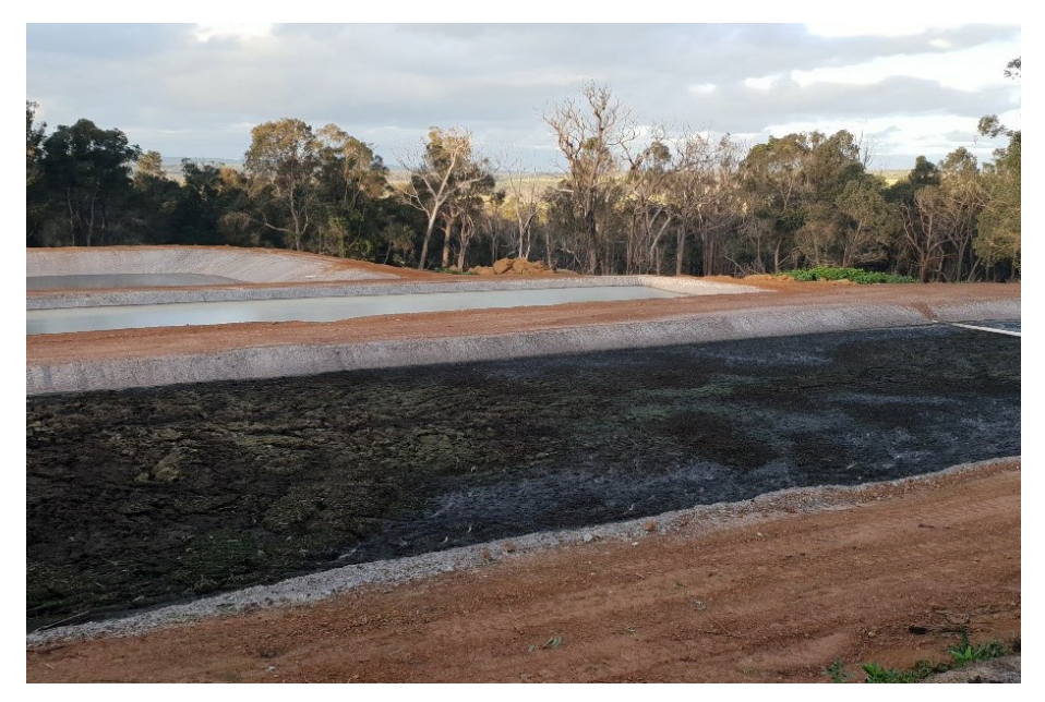
A primary solids pond is a low maintenance option to separate solids and liquids

2 Effluent and Manure Database 2008 pp. 30