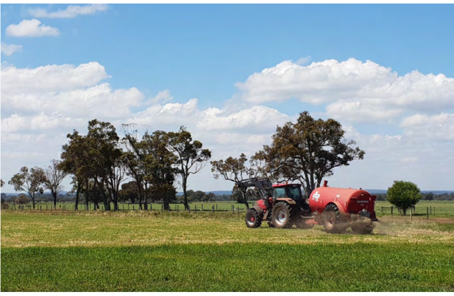
Effluent tanker

Western Dairy would also like to acknowledge all individuals and organisations, including WA dairy farmers, who provided feedback during the stakeholder consultation period and funding through the Regional Estuaries Initiative.