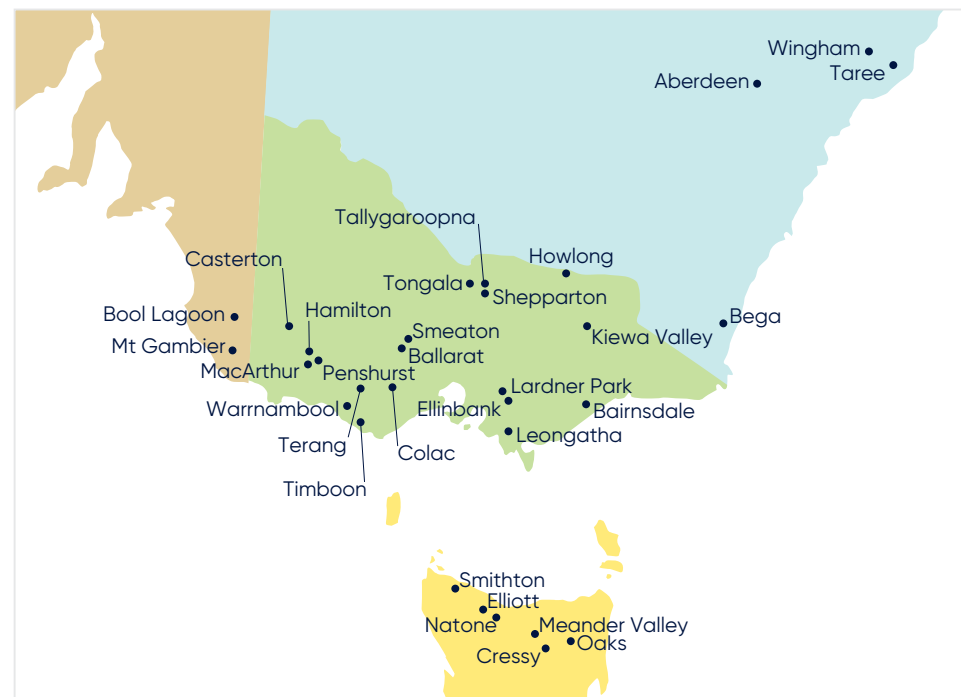
Figure 1 Map of trial locations across South-eastern Australia used in the 2025 FVI.

It is updated each year with new trial data so that farmers can have up-to-date information on the performance of newly released varieties and how they compare to existing established varieties. The FVI provides an accurate, reliable and independent assessment of the potential economic value of ryegrass cultivars across three different species (Perennial, Annual and Italian ryegrass) in a number of dairy-producing regions across Australia. The FVI is calculated by multiplying the Performance Value of each cultivar (i.e. total kilograms dry matter produced per hectare per season) by its Economic Value (i.e. the estimated value of this extra production per season). Performance Values for each variety are determined by industry assessed trial data. To be included in the FVI database, each cultivar must have data from at least three trials that have been conducted using strict industry approved protocols. This minimum trial requirement will increase over the next couple of years. For Perennial ryegrass, trials must be three years in length, while Annual and Italian ryegrass trials must be a minimum of one full growing season.