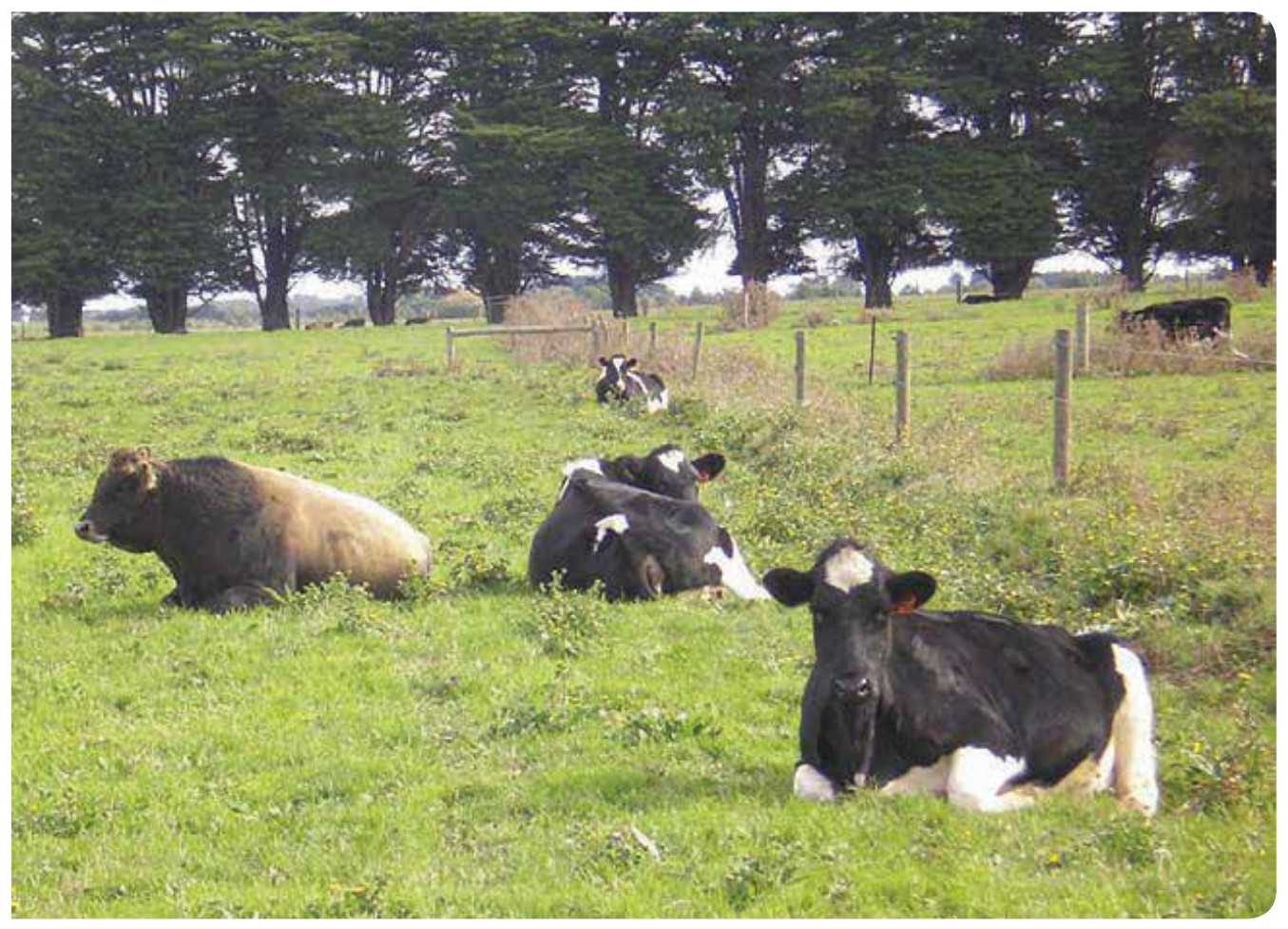
Have bulls on the farm before AI starts. It allows time for them to be well socialised before joining and avoids fighting when with the herd to establish pecking order.