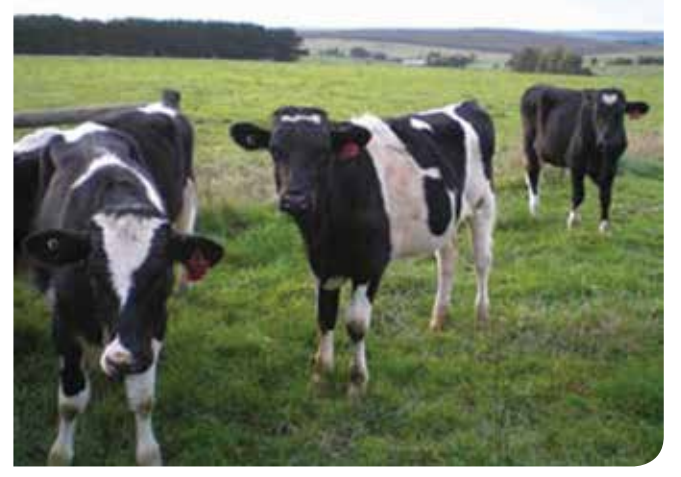
When rearing young bulls, follow the same drenching and vaccination program as for heifers.

This checklist has been compiled from The InCalf Book and the Bull Management Herd Assessment Pack Tool. Further details can be found at www.incalf.com.au