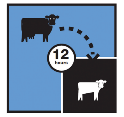
Calves should be taken off the cow within 12 hours of birth