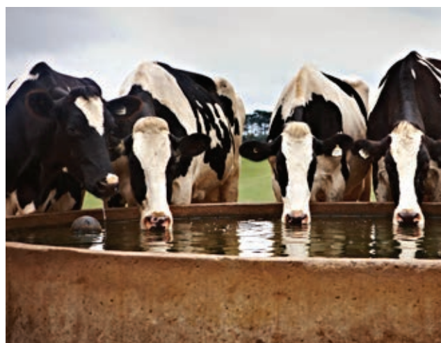
Cows drinking from water trough near dairy shed exit

Avoid running black poly pipe along the ground as the water will become very hot