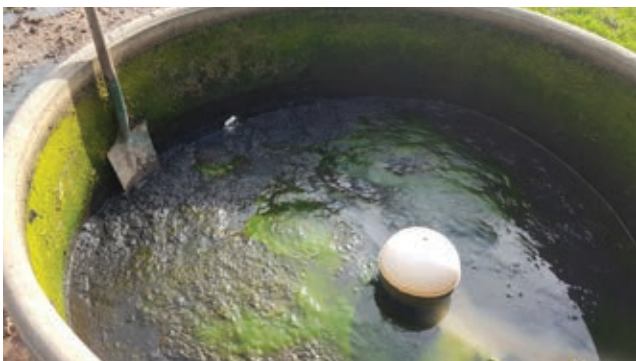
Sludge in bottom of a water trough not drained and cleaned for over two years

If installing or upgrading water troughs, try to use ones which have a large bung/release valve at the bottom so that regular cleaning of the trough is much easier.