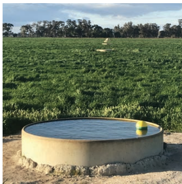
Large, bright float balls make it easy to see a problem.