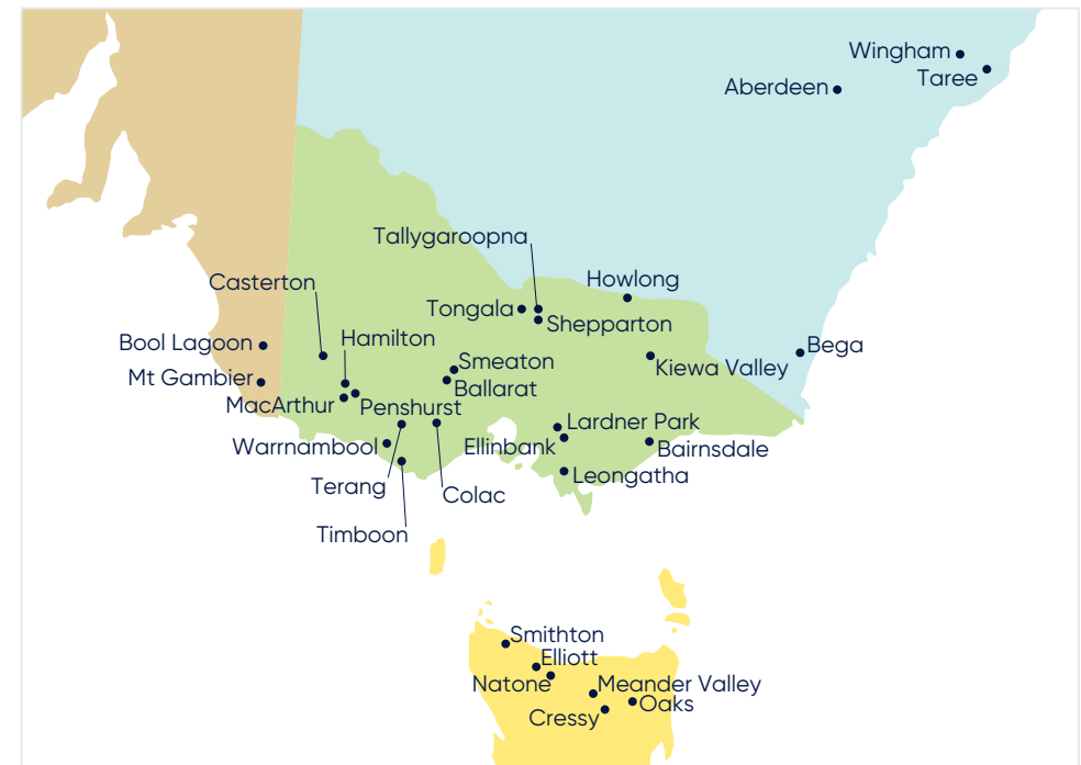
Figure 1 Map of trial locations across South-eastern Australia used in the 2025 FVI.

It is updated each year with new trial data so that farmers can have up-to-date information on the performance of newly released varieties and how they compare to existing established varieties. The FVI provides an accurate, reliable and independent assessment of the potential economic value of ryegrass cultivars across three different species (Perennial, Annual and Italian ryegrass) in a number of dairy-producing regions across Australia. The FVI is calculated by multiplying the Performance Value of each cultivar (i.e. total kilograms dry matter produced per hectare per season) by its Economic Value (i.e. the estimated value of this extra production per season). Performance Values for each variety are determined by industry assessed trial data. To be included in the FVI database, each cultivar must have data from at least three trials that have been conducted using strict industry approved protocols. This minimum trial requirement will increase over the next couple of years. For Perennial ryegrass, trials must be three years in length, while Annual and Italian ryegrass trials must be a minimum of one full growing season.